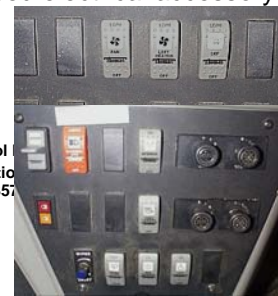
2004 Type-C School NCDPI Transportatio (919) 807-357

Control Panel - To the left of the driver, there shall be installed an enclosed electrical accessory panel that can be easily removed for servicing. Inside the panel shall be located all relays, switches (including heater and defroster), junction block, circuit breakers, flasher units, and door buzzer. The