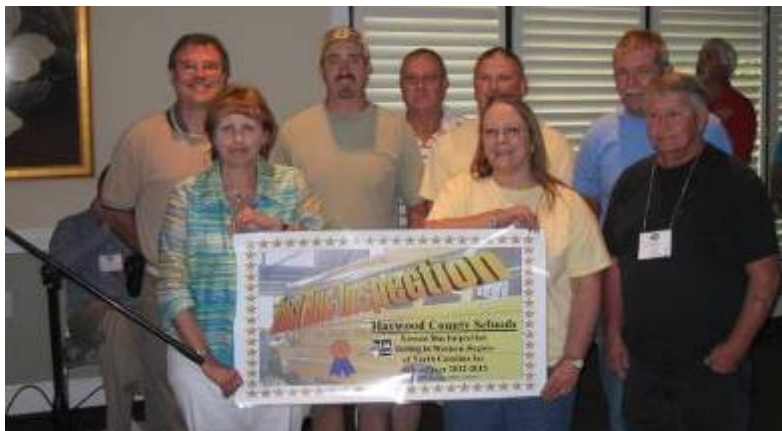
1 st place Western Region-Haywood County Transportation Department

Congratulations go out to all of the transportation employees for the extra effort it takes to win the banner.