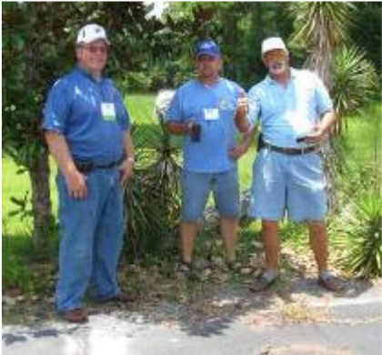
A shady spot was hard to find