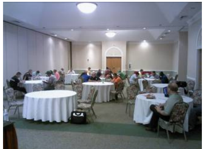
26 of NC's best took the written test in order to qualify for the final "12"