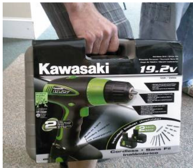
The top 12 received a cordless drill