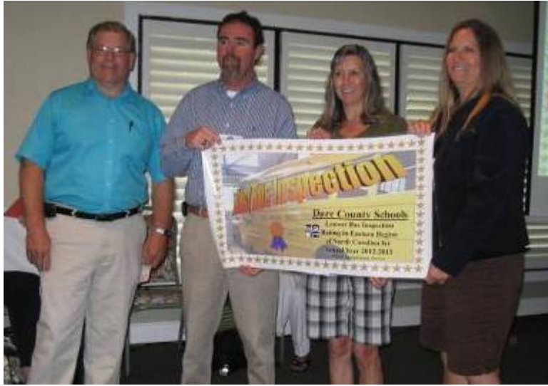
1 st place Eastern Region-Dare County Transportation Department

The “best inspection” banners were handed out at the NCPTA award session at Sea Trails on July 18 th , 2013