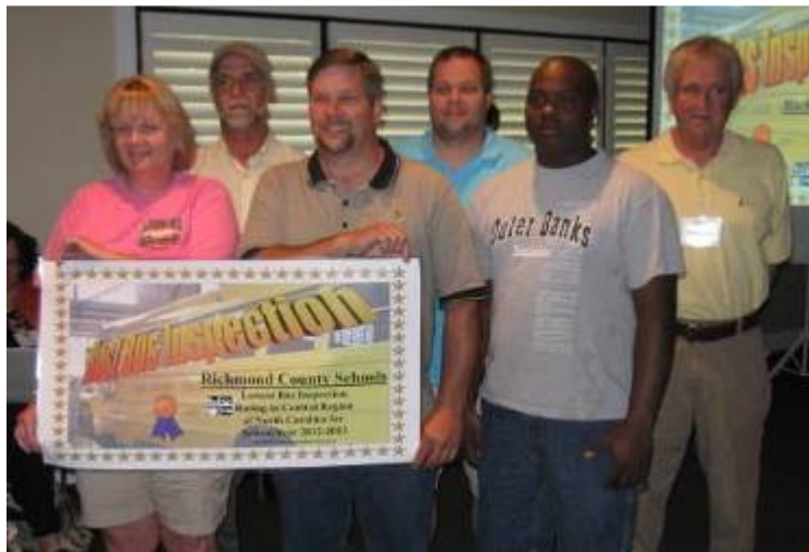
1 st place Central Region-Richmond County Transportation Department