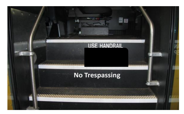
This location is alternative to previous slides showing separated decal location higher, out of the kick zone

Entrance step shall extend below skirt line to such depth as necessary to make the distance to the ground from the bottom of the step no less than 10 inches and no more than 14 inches.