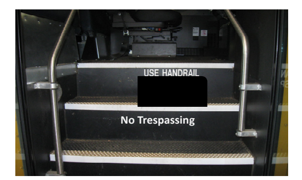
This location is alternative to previous slides showing separated decal location higher, out of the kick zone

STEPWELL - A step well, having three steps, shall be built into the front assembly and completely enclosed with doors extending to bottom step. Each step shall be 14-gauge steel construction and covered with ribbed rubber or elastomer material as per the 2015 National Standards. The top step riser is to include approximate 2 inch contrasting letters at top edge of step riser stating "USE HANDRAIL". The top edge of riser for next lower step is to include in same sized letters "NO TRESPASSING".