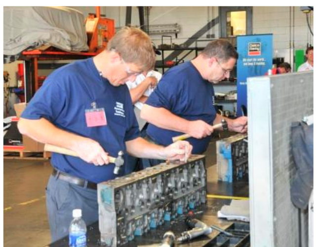
Two technicians work to complete a station involving a broken head bolt R&R