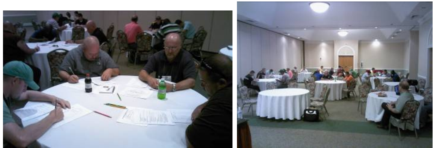
26 of NC's best took the written test in order to qualify for the final "12"