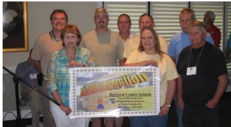
1<sup>st</sup> place Western Region-Haywood County Transportation Department

Congratulations go out to all of the transportation employees for the extra effort it takes to win the banner.