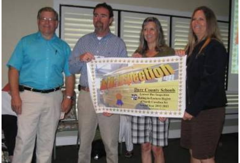
1<sup>st</sup> place Eastern Region-Dare County Transportation Department

The "best inspection" banners were handed out at the NCPTA award session at Sea Trails on July 18th, 2013