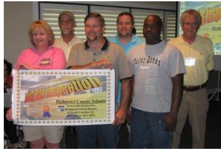
1<sup>st</sup> place Central Region-Richmond County Transportation Department