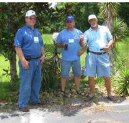
A shady spot was hard to find