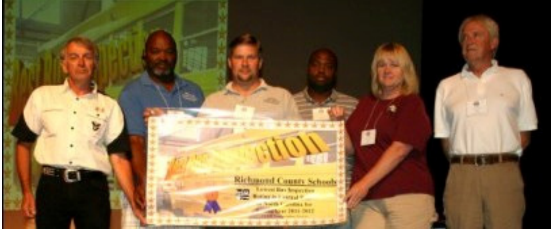
1<sup>st</sup> place Central Region-Richmond County Transportation Department