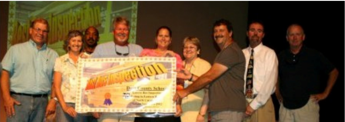
1<sup>st</sup> place Eastern Region-Dare County Transportation Department

The "best inspection" banners were handed out at the NCPTA opening session at Kill Devil Hills on June 27th, 2012