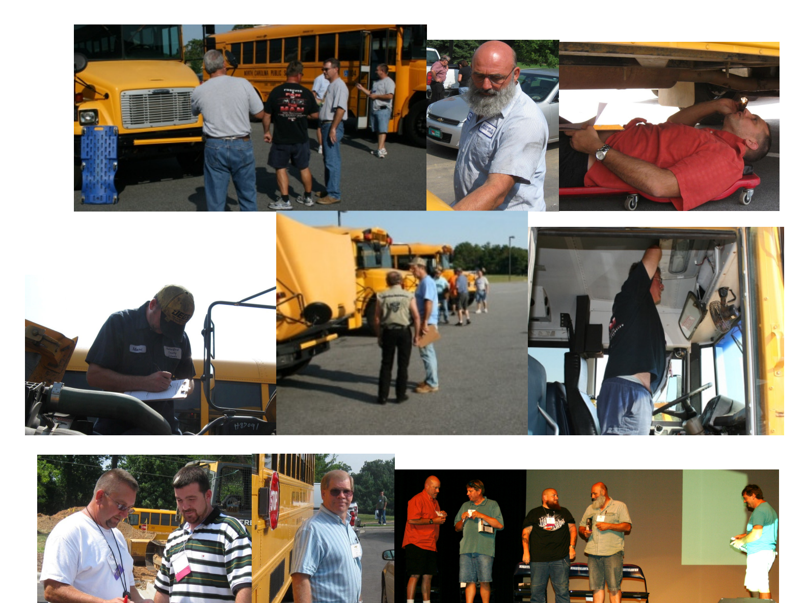
Thanks to all of the competitors who took time to participate and the folks who help make this event a success.